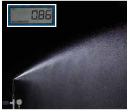
1800 Spray with PRS at 79 psi inlet pressure. PRS regulates flow to 0.86 gallons per minute.