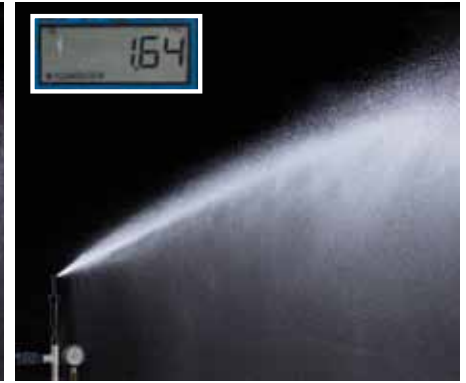
Non-PRS competitive spray at 79 psi inlet pressure. Without PRS, flow rises to 1.64 gallons per minute.

In this test, Rain Bird® PRS Rotors can save 0.70 gpm by reducing operating pressure to 45 psi.