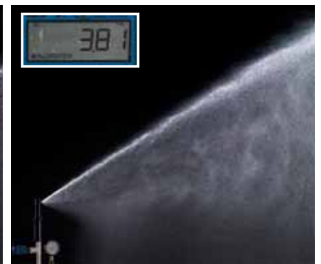
Non-PRS competitive rotor at 79 psi inlet pressure. Without PRS, flow rises to 3.81 gallons per minute.